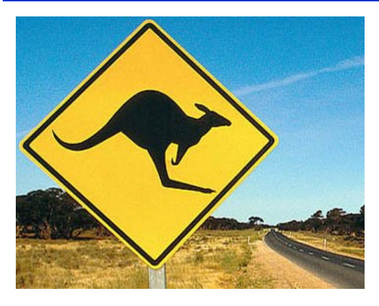
G'day, caregiver mates!

The first member to join FSJC online lives in West Perth, Australia! We truly are a worldwide organization.